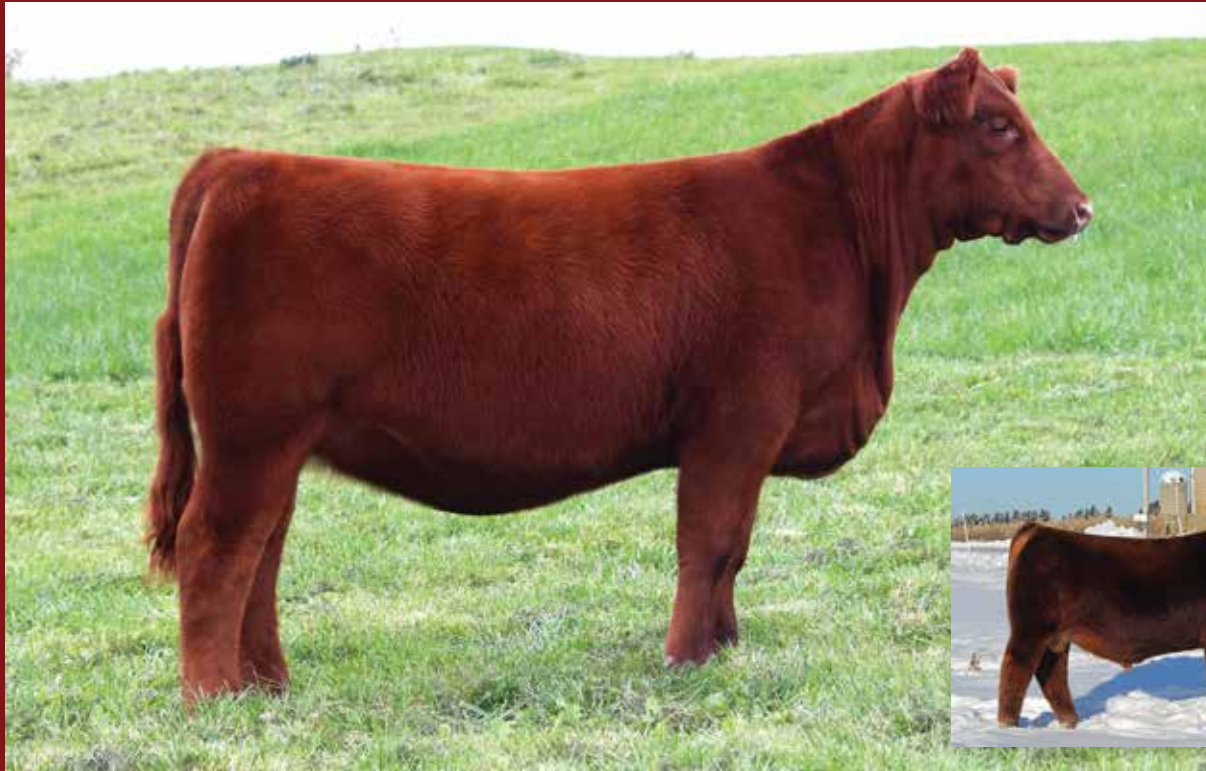
Heartless Sire of Lot 20