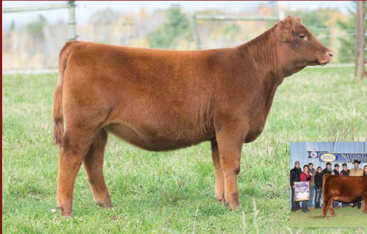
Full Sister to Lot 36