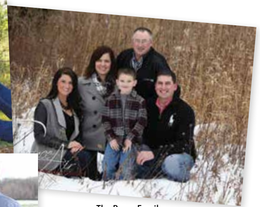
The Bayer Family