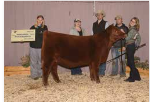
Third Overall Female 2017 Cattle Battle Congratulations to the Farmer Group Sold in the 2016 Event!