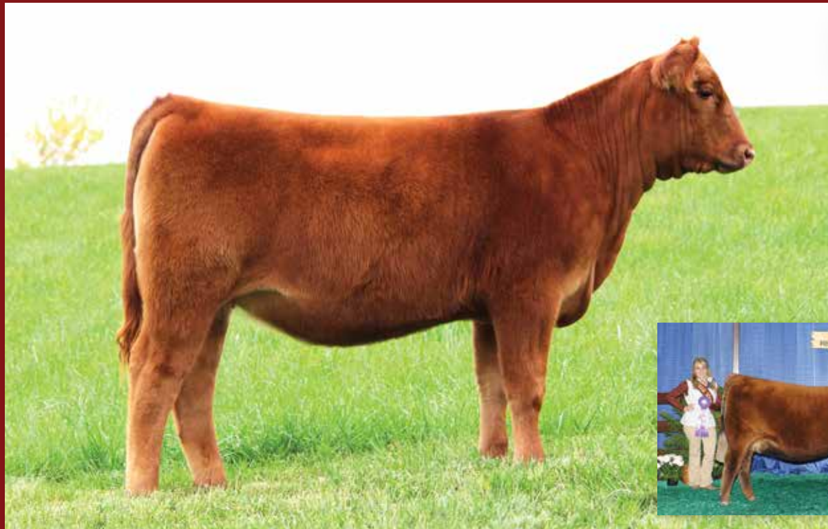
Cover Girl Full Sister in Blood to Dam of Lot 31