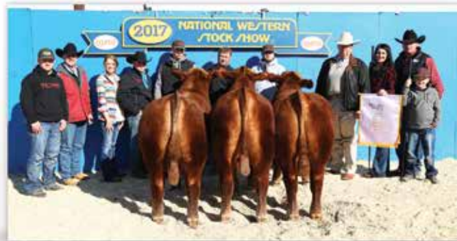
2017 RESERVE CHAMPION PEN OF RED ANGUS BULLS NATIONAL WESTERN STOCK SHOW - TC REDS