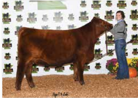
Champion Female 2017 MN State Fair Red Angus Show Congratulations Roscoe Center Red Angus Sold in the 2016 Event!