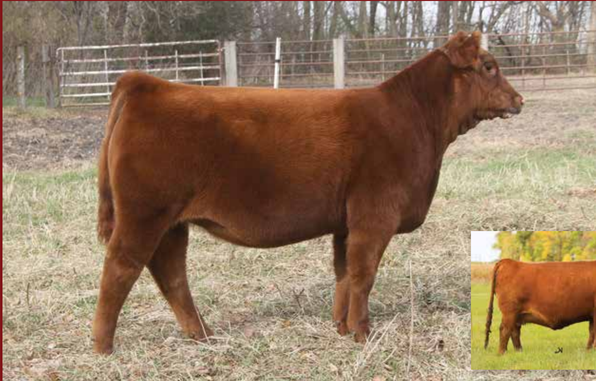
Caroline Dam of Lot 15 & 19