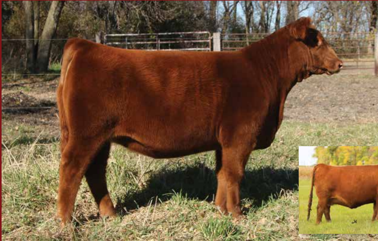
Caroline Dam of Lot 15 & 19