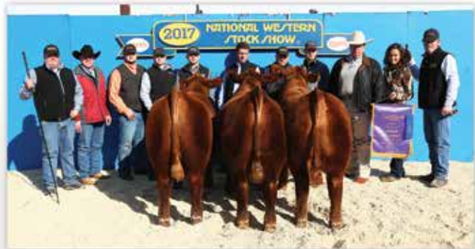
2017 CHAMPION PEN OF RED ANGUS BULLS NATIONAL WESTERN STOCK SHOW - WEBER LAND & CATTLE

PUREBRED RED ANGUS BULL SALE - MARCH 7, 2018