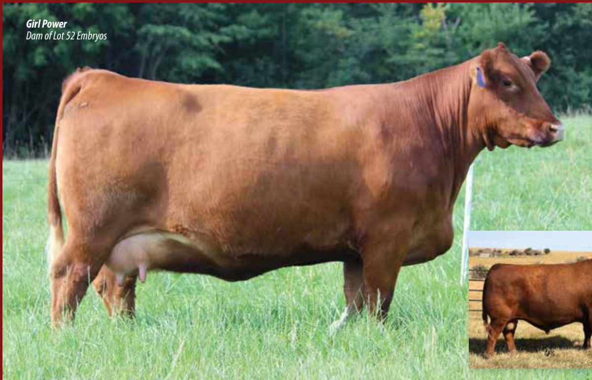
Girl Power Dam of Lot 52 Embryos