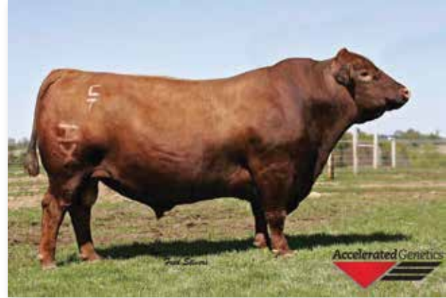
CONQUEST - Service Sire to Lot 40