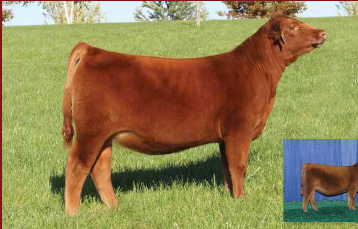
Paternal Sister to Lot 23