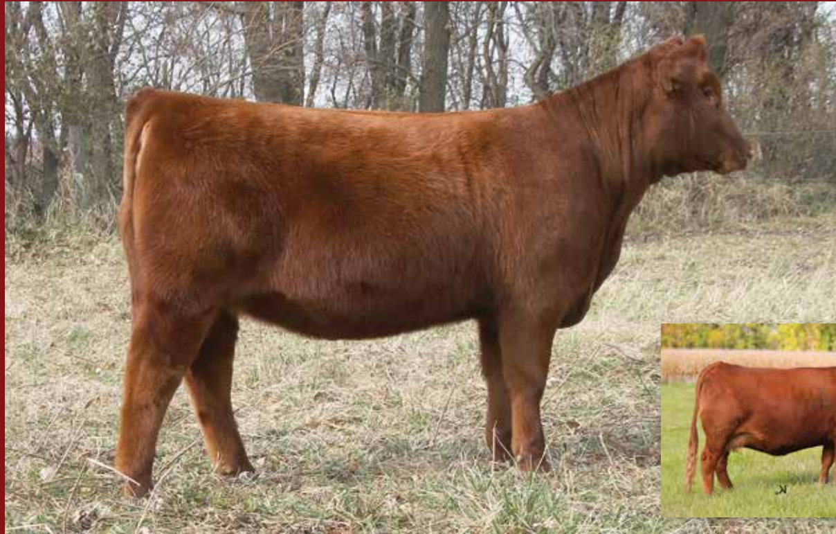
Brandy Dam of Lot 8