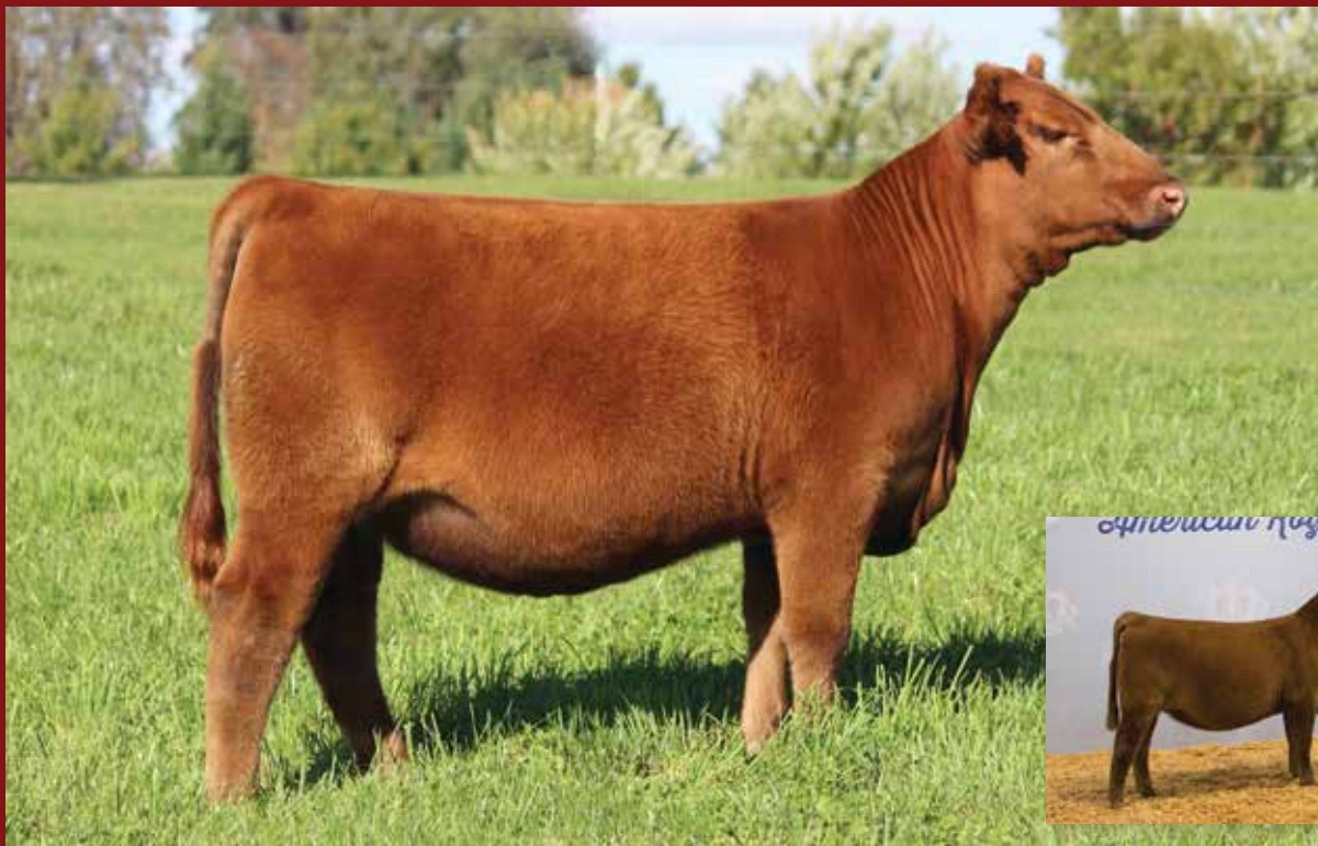
Jewel Named AOB Calf Champion 2017 American Royal