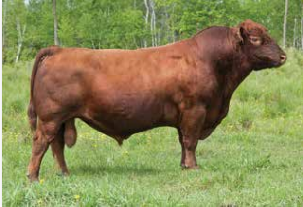
HAMLEY - Sire of Lot 37